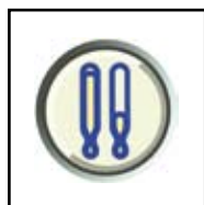
Fixturlaser OL2R XA