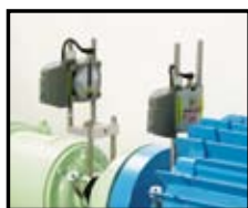
Extension Fixture XA