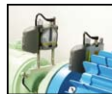
Thin Chain Fixture XA