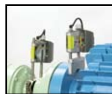
Magnetic Brackets XA