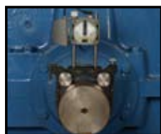
Fixture for Non-Rotating Shafts XA