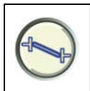
Fixturlaser Offset XA