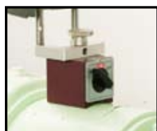
Magnetic Base XA